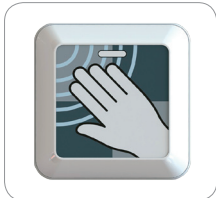
Sticker Option 1