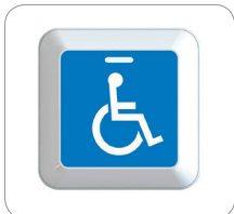
Sticker Option 2