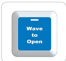
Sticker Option 3