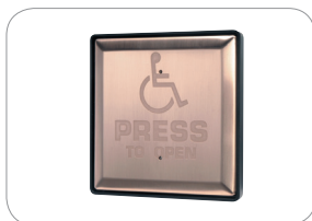
C6S1 Hardwired Copper 6" (152mm) Square