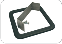
4UFK Recess mounting kit for C4S1U0 and C4S1U4