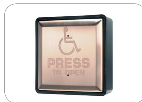
C6S1U0 Hardwired Copper 6" (152mm) Square w/ Universal Box