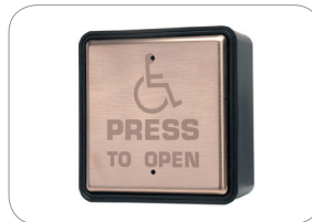
C4S1U0 Hardwired Copper 4 1/2" (115mm) Square w/Universal Box