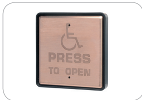
C4S1 Hardwired, Copper 4 1/2" (115mm) Square