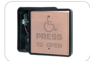
C4S1U4 Wireless Copper 4 1/2" (115mm) Square w/ Universal Box and 433 MHz transmitter