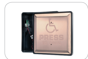
C6S1U4 Wireless Copper 6" (152mm) Square w/ Universal Box and 433 MHz Transmitter